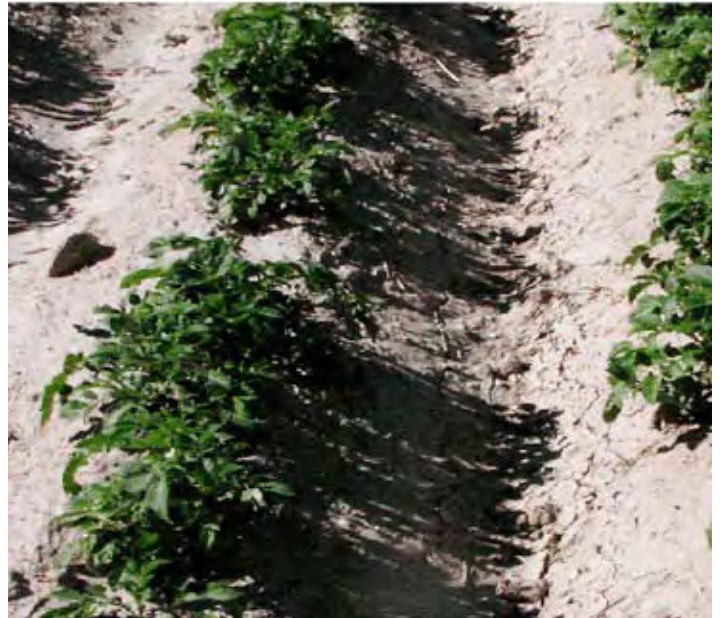
Figure 2: Potato injury due to late application of Chateau.

The Nebraska Potato Eyes is on the World Wide Web at: www.panhandle.unl.edu/peyes.htm