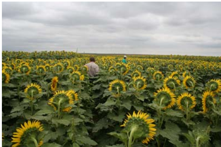
Figure 2. Nebraska producers are proving the potential for double-cropping sunflower after wheat.

An advantage of sunflower and canola production over other alternative oilseeds is that production practices and co-product markets are common outside of Nebraska and could be adopted from near-by regions. Due to the higher oil content, mechanical processing facilities may be feasible at the local level rather than transporting oilseeds long distances to large scale solvent extraction facilities. More importantly, sunflowers and canola can produce oil that is highly desirable for human consumption. In efforts to produce healthier foods, the food industry has commitment to eliminating or lowering trans fats and lowering saturated fat levels. With that in mind, oilseed processors may have the opportunity to market the oil into premium food grade markets. If the premium markets are fully supplied, a strong market will likely still exist for the commodity based biodiesel feedstock market.