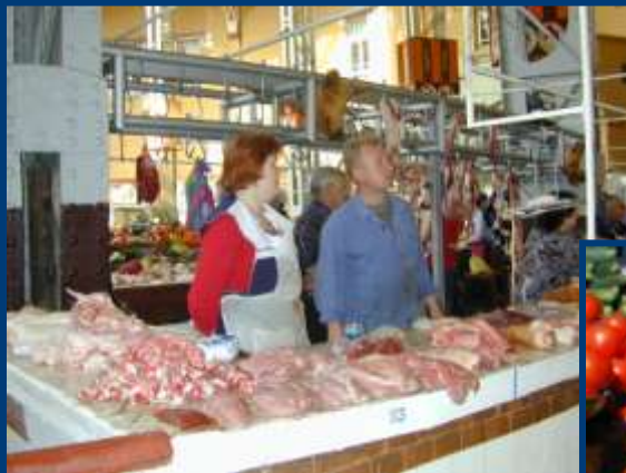
Indoor Market in Kiev