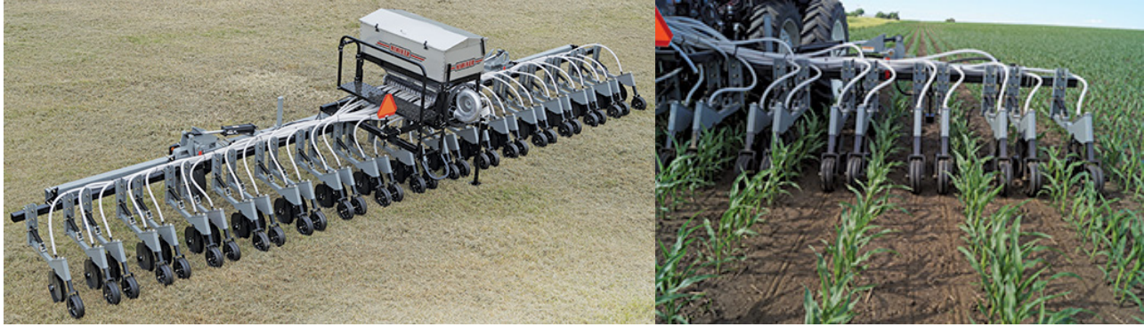
Figure 1. Hiniker twin row interseeder used to establish cover crops. Images from Hiniker ( https://www.hiniker.com/ag_products%20new/sp_cover-crop-seeders.html ).

The 2018 corn crop was harvested on October 6 and evaluated for yield and moisture. Spatial yield data is shown in Figure 2.