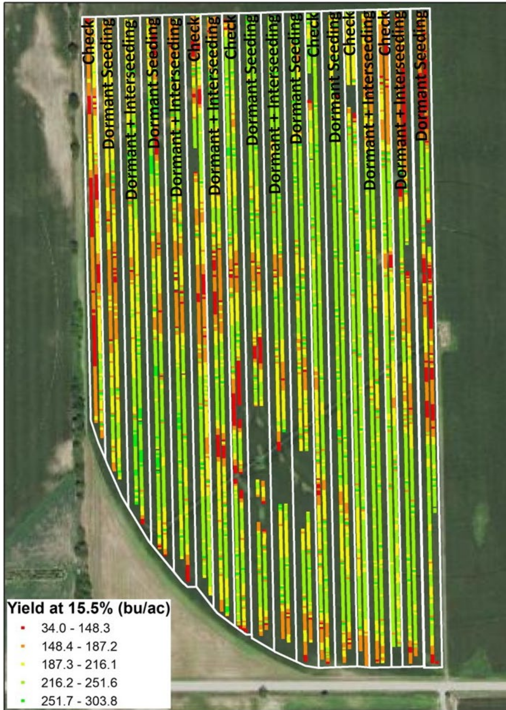
Figure 2. Cleaned yield data from yield monitor for study area with treatment strips overlaid (white outlines).