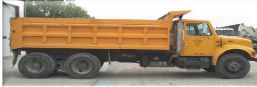
NE Type 3 – 25 Ton