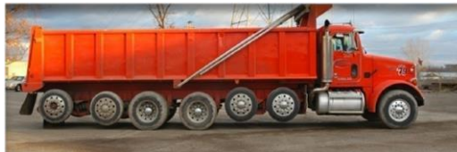
SU7 – 38.75 Ton