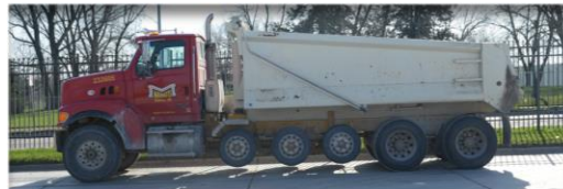
SU6 – 34.75 Ton