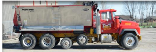
SU5 – 31 Ton