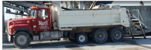
SU4 – 27 Ton