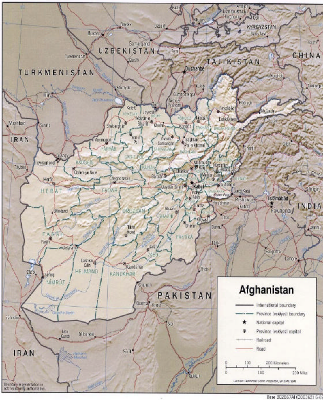
Figure 1. Map of Afghanistan showing its location in the region